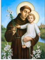
Saint Anthony of Padua