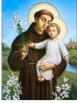
Saint Anthony of Padua