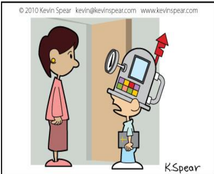
"I'm all ready for Sunday school. I have my Bible and thinking cap."