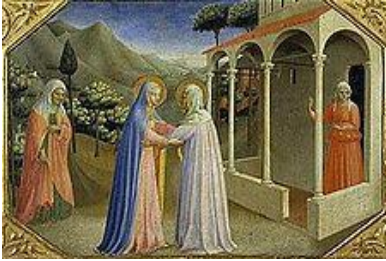
The Annunciation of the Lord

SATURDAY, March 25 th 5 th SUNDAY OF LENT